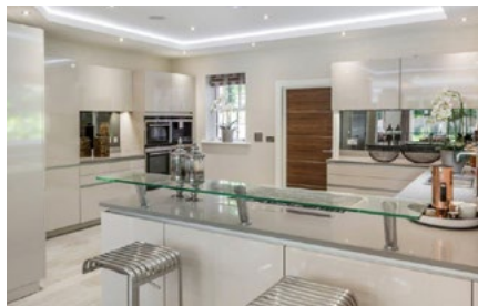
Left: High end large open plan kitchen with stylish glass breakfast bar for one of Whiteoak Developments luxury properties.