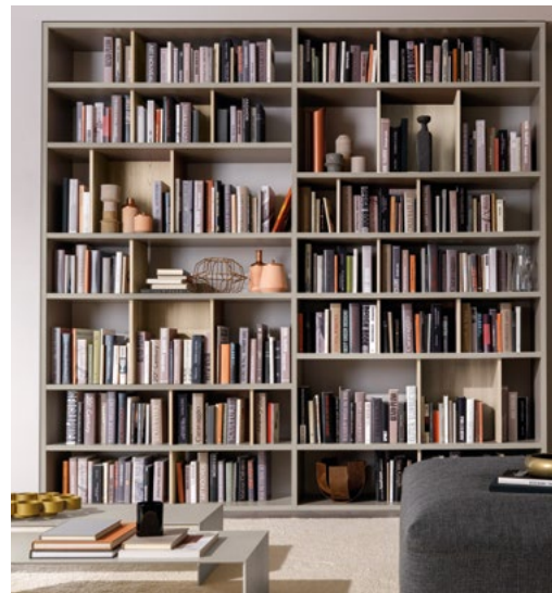
Right: Examples of bespoke freestanding & built in living room furniture.