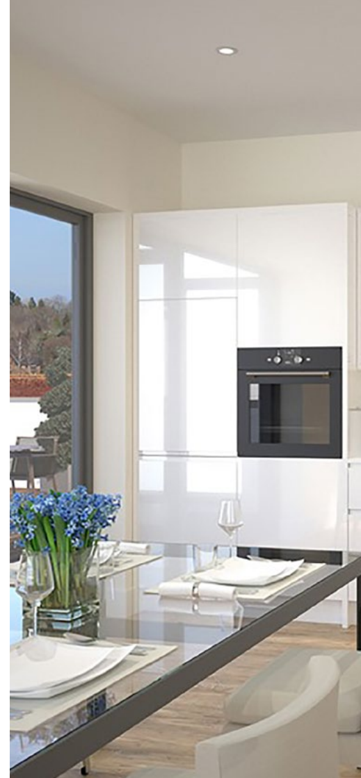
Right: Integrated appliance for the contemporary space at Milton House.