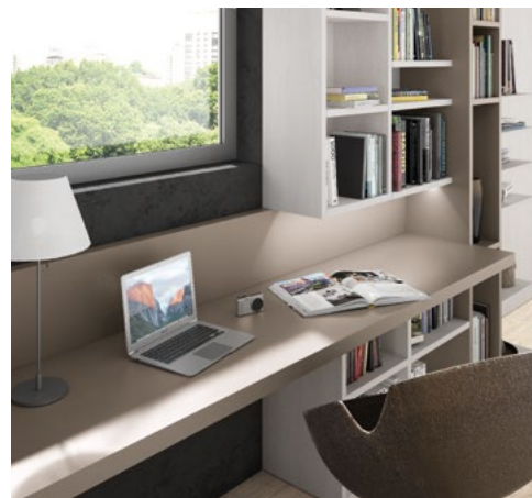
Right: Bespoke home office & storage solution.