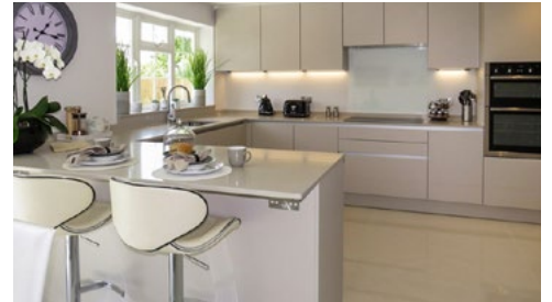
Top & Bottom: Milton House, Haywards Heath complex of 28 kitchens.